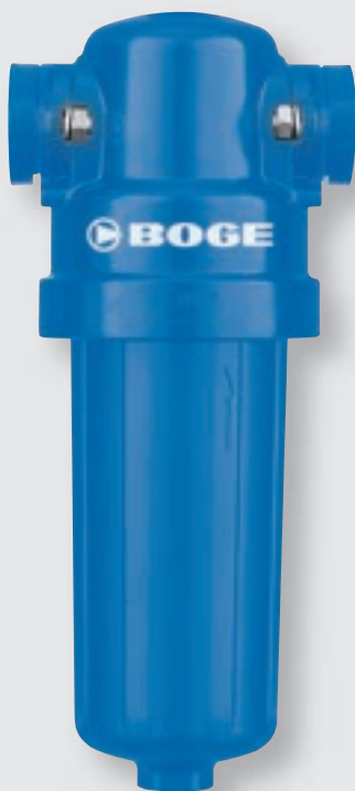
Z 20N – Z 183N