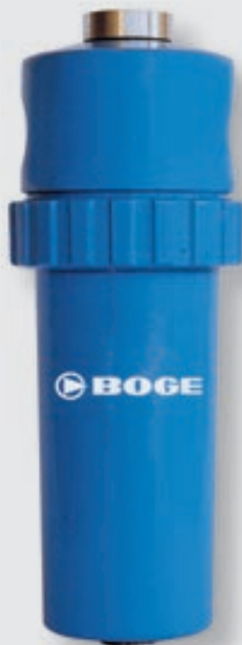
Z 275 – Z 375

Apart from the drain, the cyclone separator operates wear free because there are no moving parts which means increased output of the compressed air treatment system.