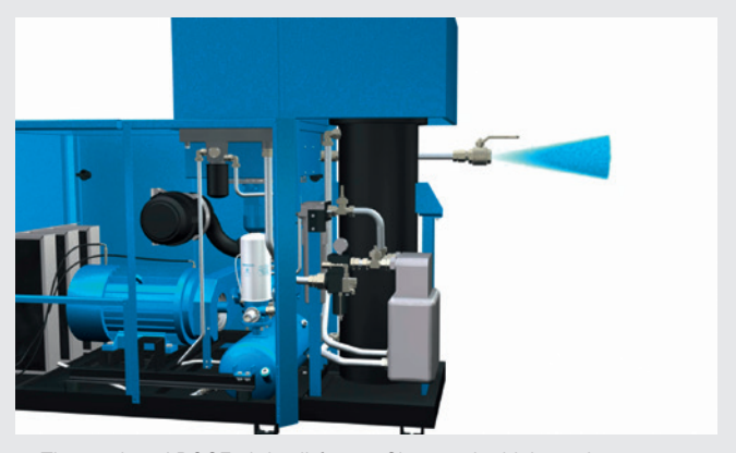
4. The produced BOGE air is oil-free to Class 0, the highest class.