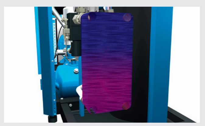
1. The compressed air is pre-heated to 200°C.