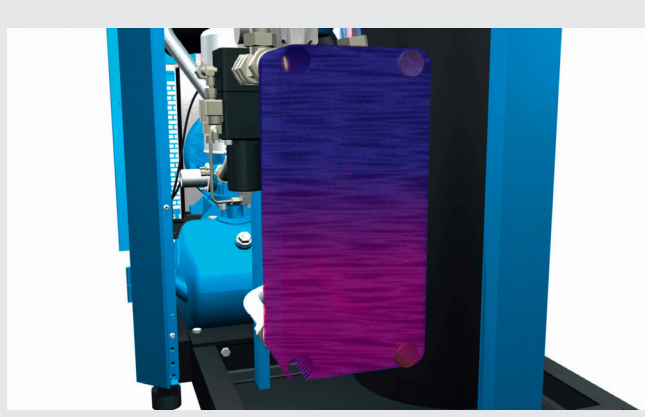
1. The compressed air is pre-heated to 200°C.