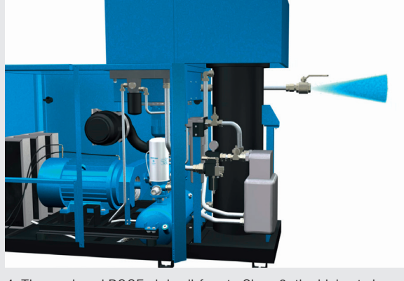
4. The produced BOGE air is oil-free to Class 0, the highest class.