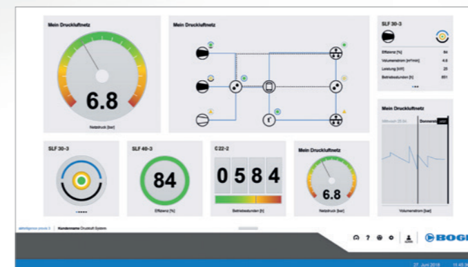
Your individual dashboard