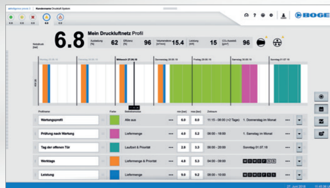
Your compressed air profile