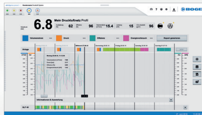
Your profile in the process